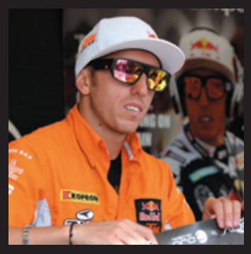
Tony Cairoli, 7 x Motocross World champion