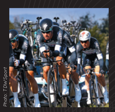
Team Omega Pharma Quick Step